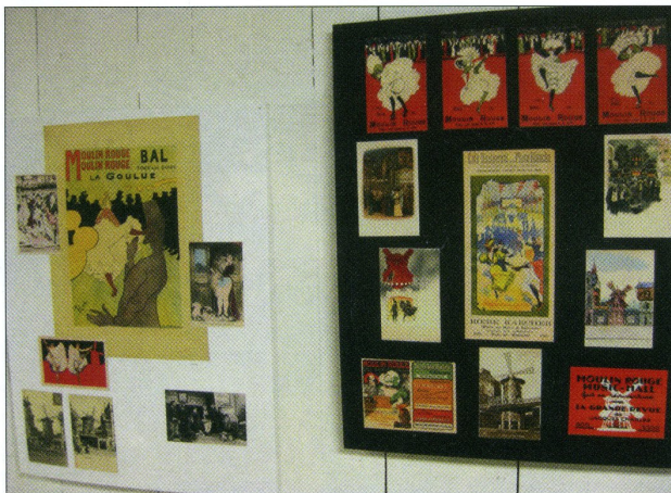
The walls in the café had beautiful displays with selected cabaret/variety items, matching the theme of the poster for the Show